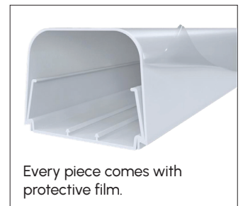
Every piece comes with protective film.